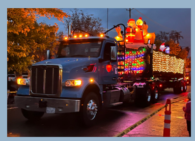
Great job to the setup crews and drivers participating in these events across CA, OR and WA!